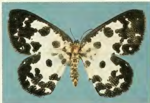
Fig. 8. Inouea hiroshii , spec. nov., Paratype, ♀, Mindanao.

Length of forewing ♂ 18-20 mm, ♀ 21 mm. Ground colour of ♂ orange red, slightly lighter than in the preceding species. Markings black. Forewing costa black, irregularly bordered towards wing area, broader than in I. hiroshii . Terminal area of forewing black, very broad, extended all over distal half of wing and including also submarginal row of spots (rarely with scarce rest of ground colour visible between spots). Cell spot large, oval, usually fused